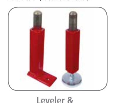
Floor Supports Optional supports are available for our Mobile Locker systems. Available with adjustable supports for placement on uneven, sloping floors and bolt-down supports if you prefer a fixed location.