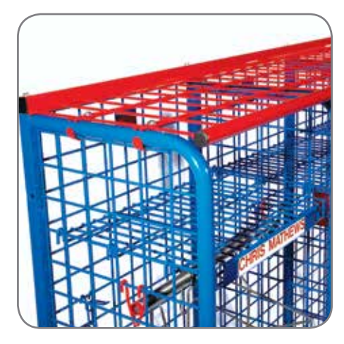
Top-Side Storage <sup>™</sup>

GearGrid's Top-Side Storage allows you to store bulky items on top of lockers. Can be installed on new and existing systems.