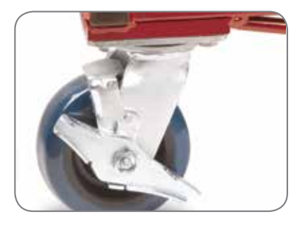
Locking Casters Locking casters handle up to 950 lbs. each

Add Power Bar to the Slinger for easy access to electrical outlets for your power tool needs *Note: Does not require UL approval. Please check with appropriate officials regarding local requirements.