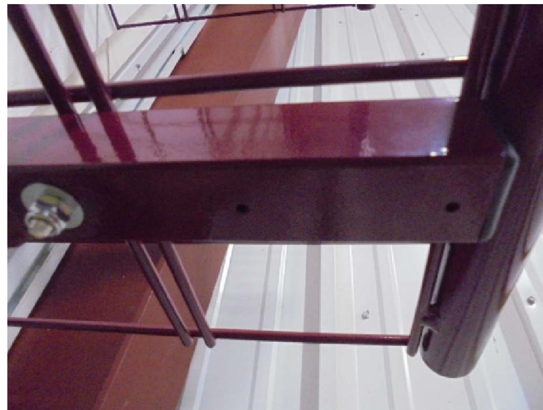
IMAGE SHOWS WASHER AND BOLT IN POSITION ON TOP. INSTALL HARWARE ON EACH BRACKET. USE WASHERS ON THE BOTTOM SIDE AND HAND START THE NUTS. ONCE SHELF IS POSITIONED THEN TIGHTEN HARDWARE.