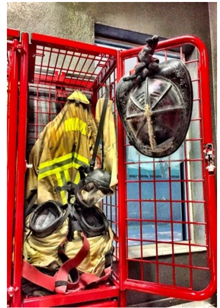
GearGrid Two-Tier Locker